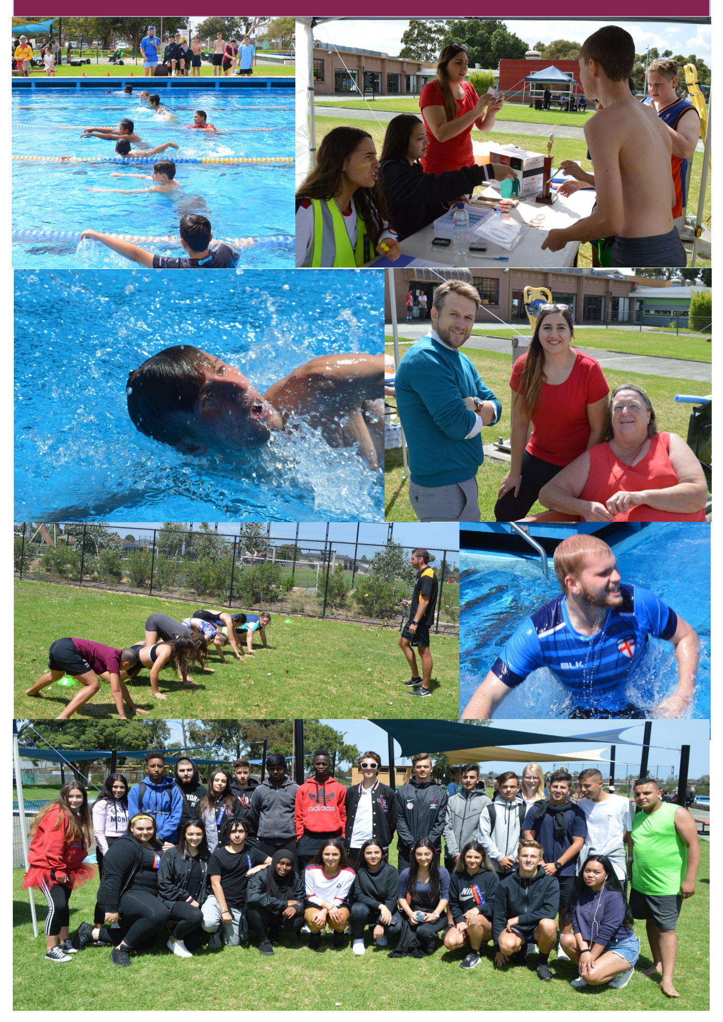
John Fawkner College Newsletter—No. 1—2018