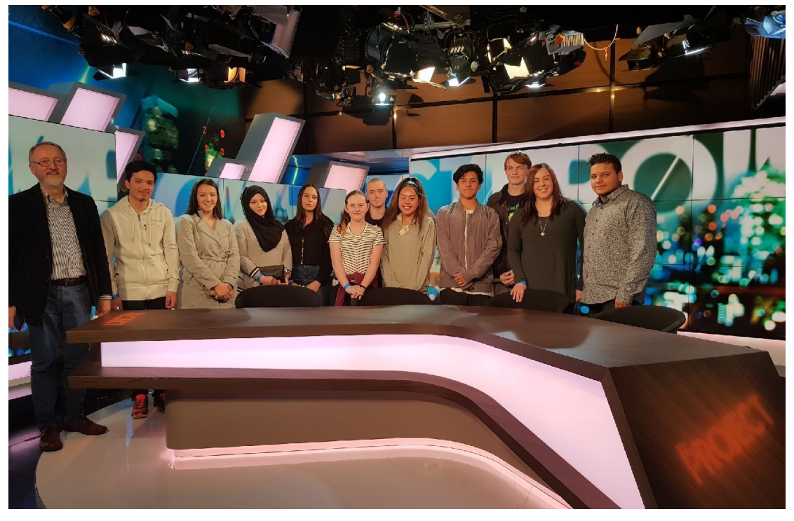
John Fawkner College Newsletter-No.10-2017