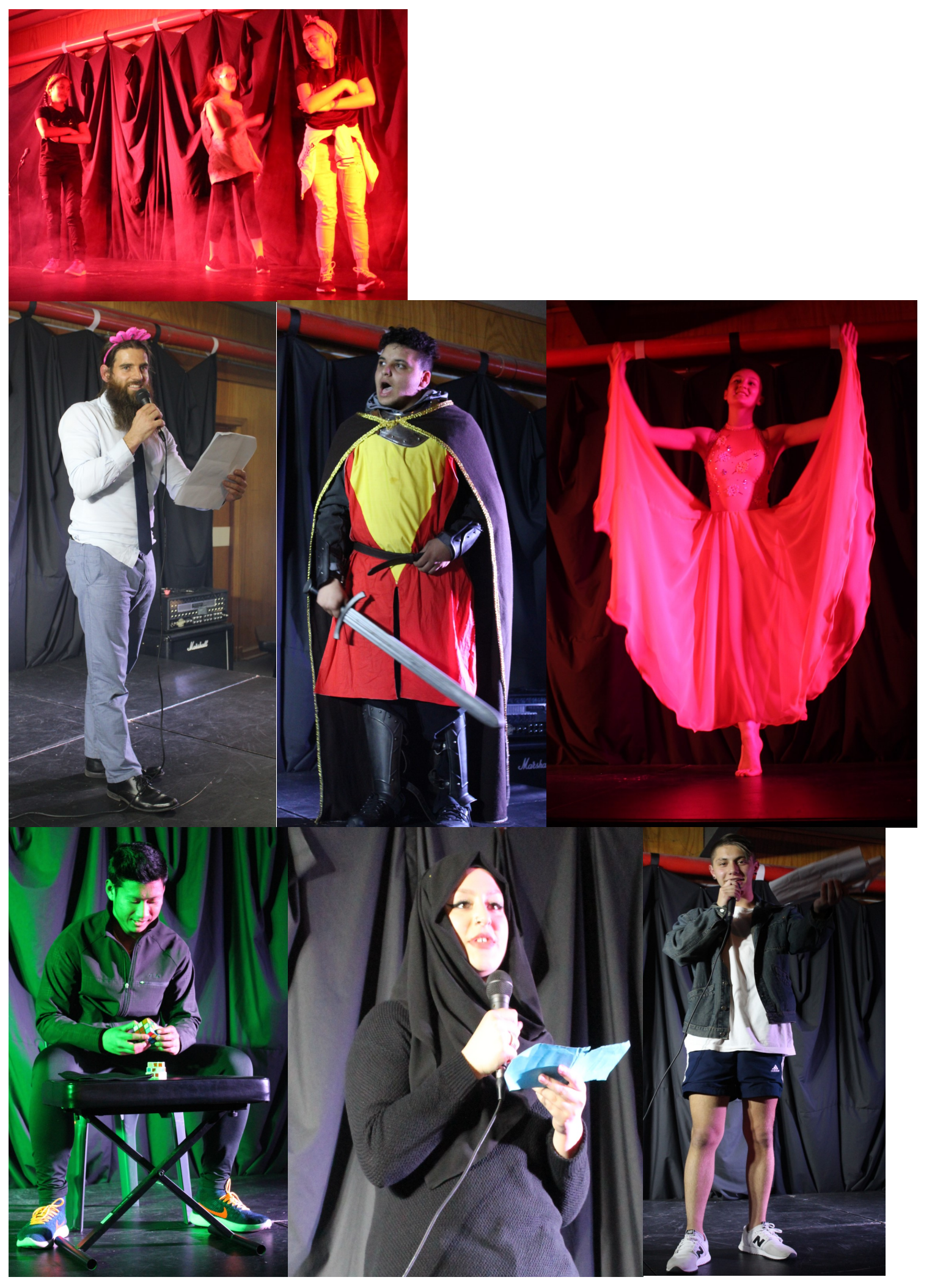
John Fawkner College Newsletter—No.10—2017