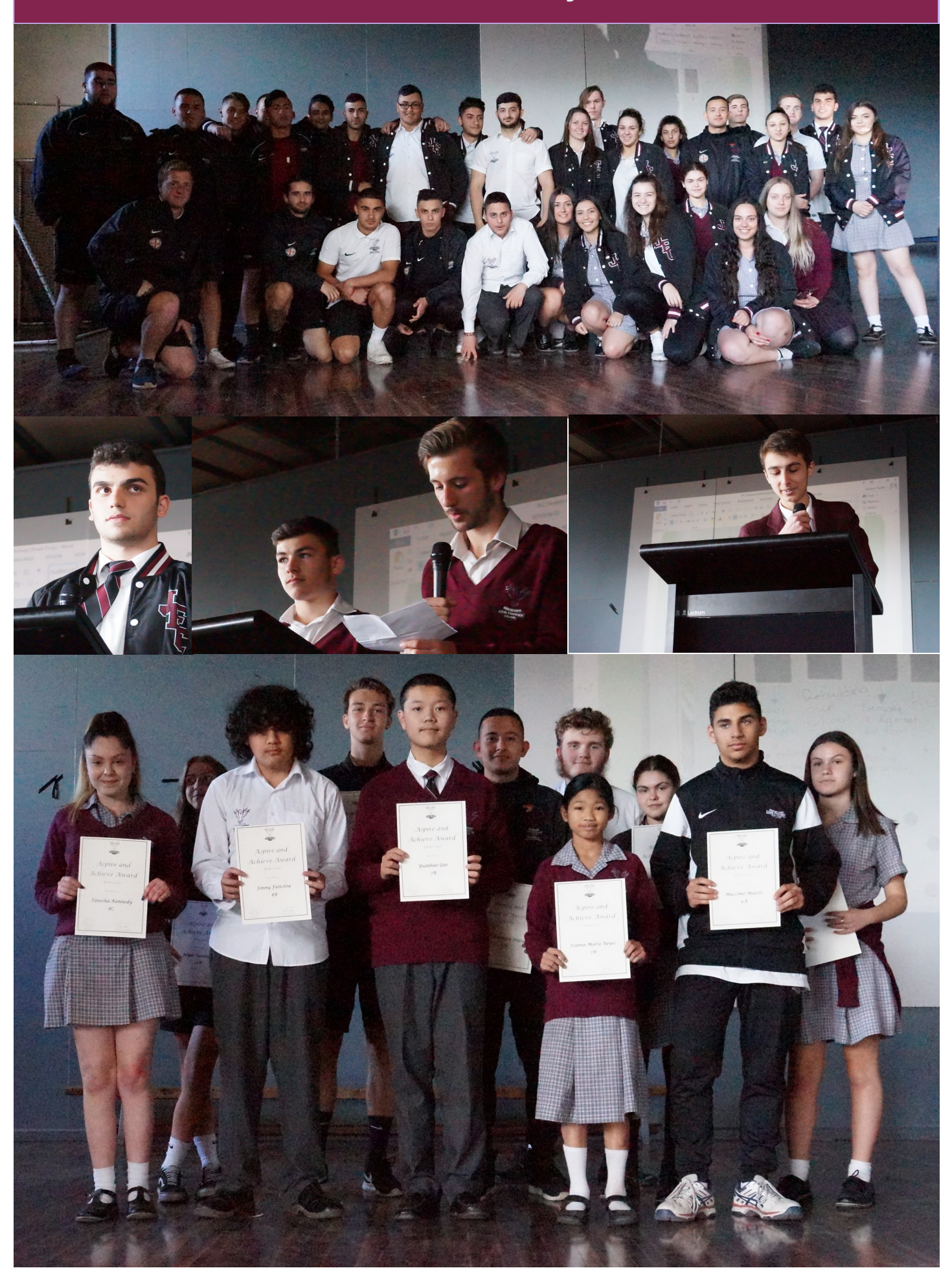
John Fawkner College Newsletter—No.10—2017