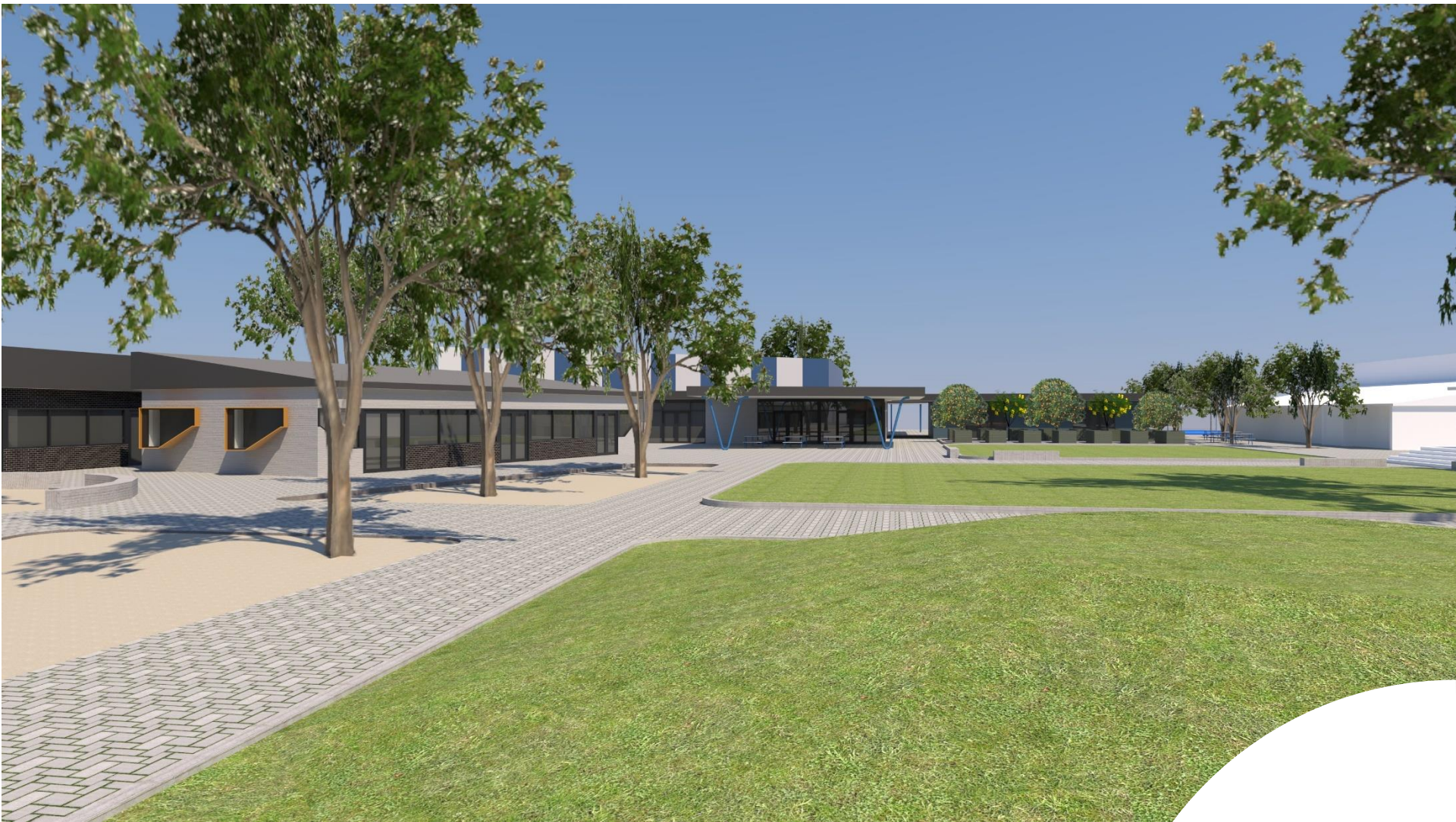
VIEW FROM CENTRAL LAWN TOWARDS CLASSROOMS & GYMNASIUM