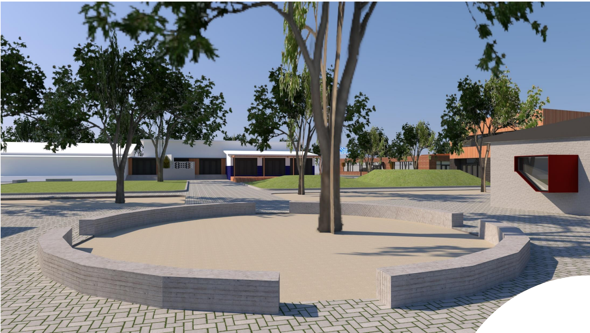
VIEW OF CENTRAL LAWN FROM SOUTH