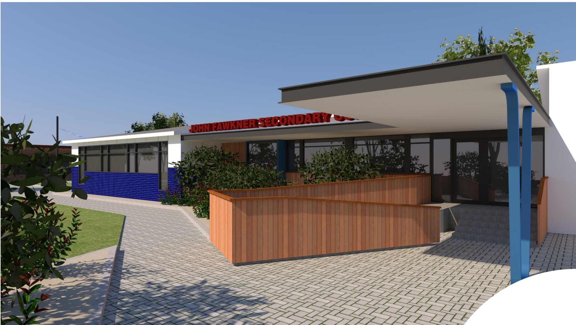
VIEW OF ENTRY & LIBRARY