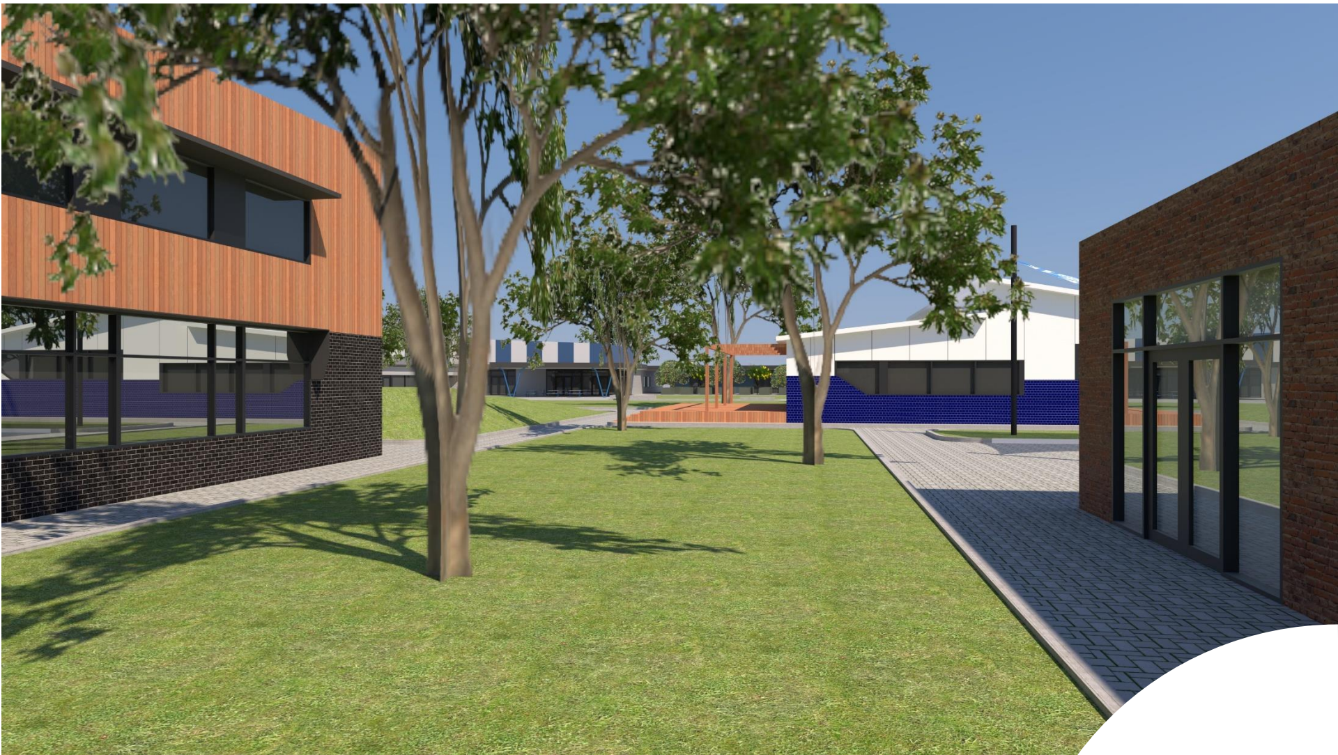
VIEW FROM SCIENCE COURTYARD