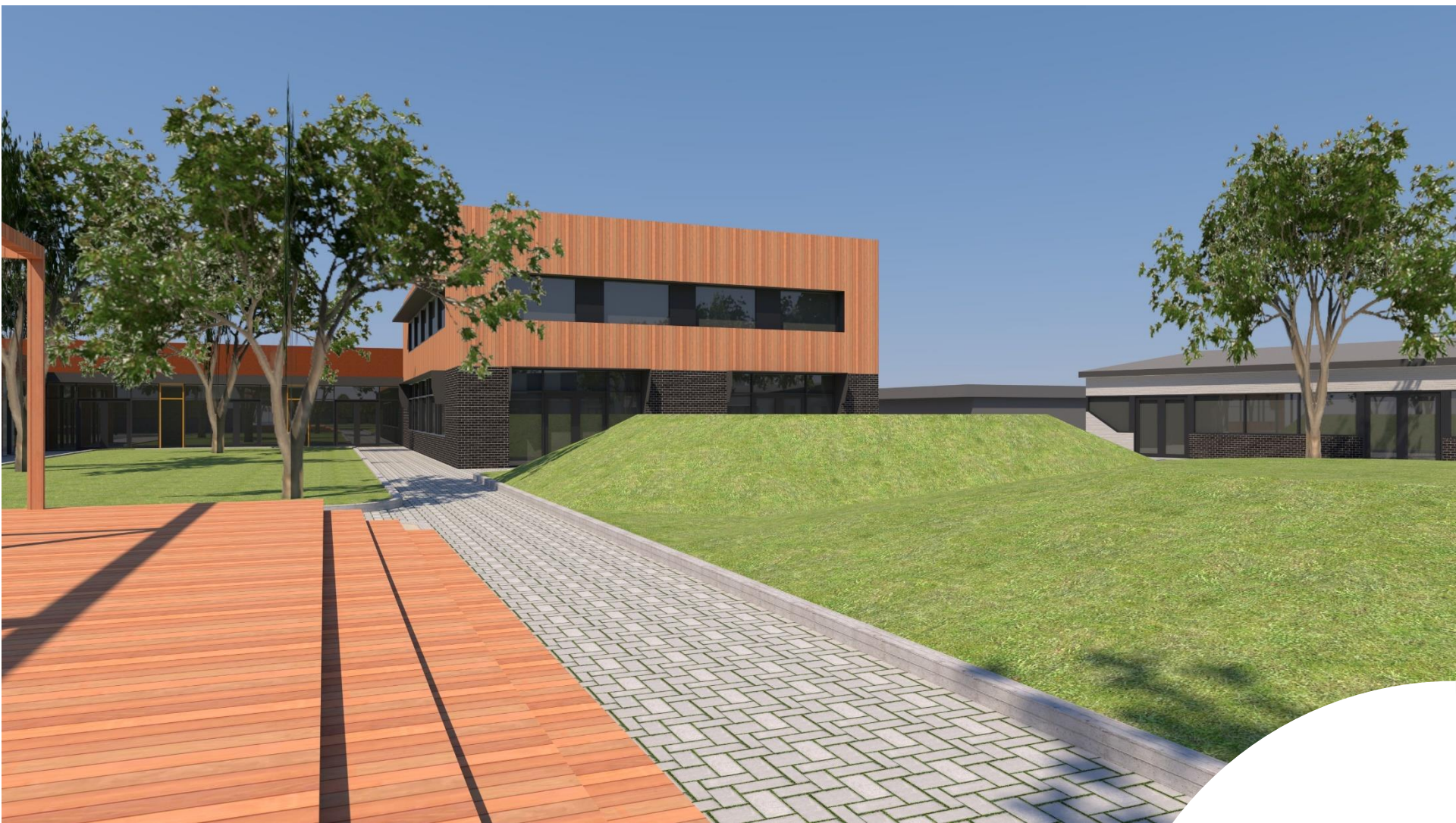
VIEW TOWARDS 2-STOREY SCIENCE BUILDING