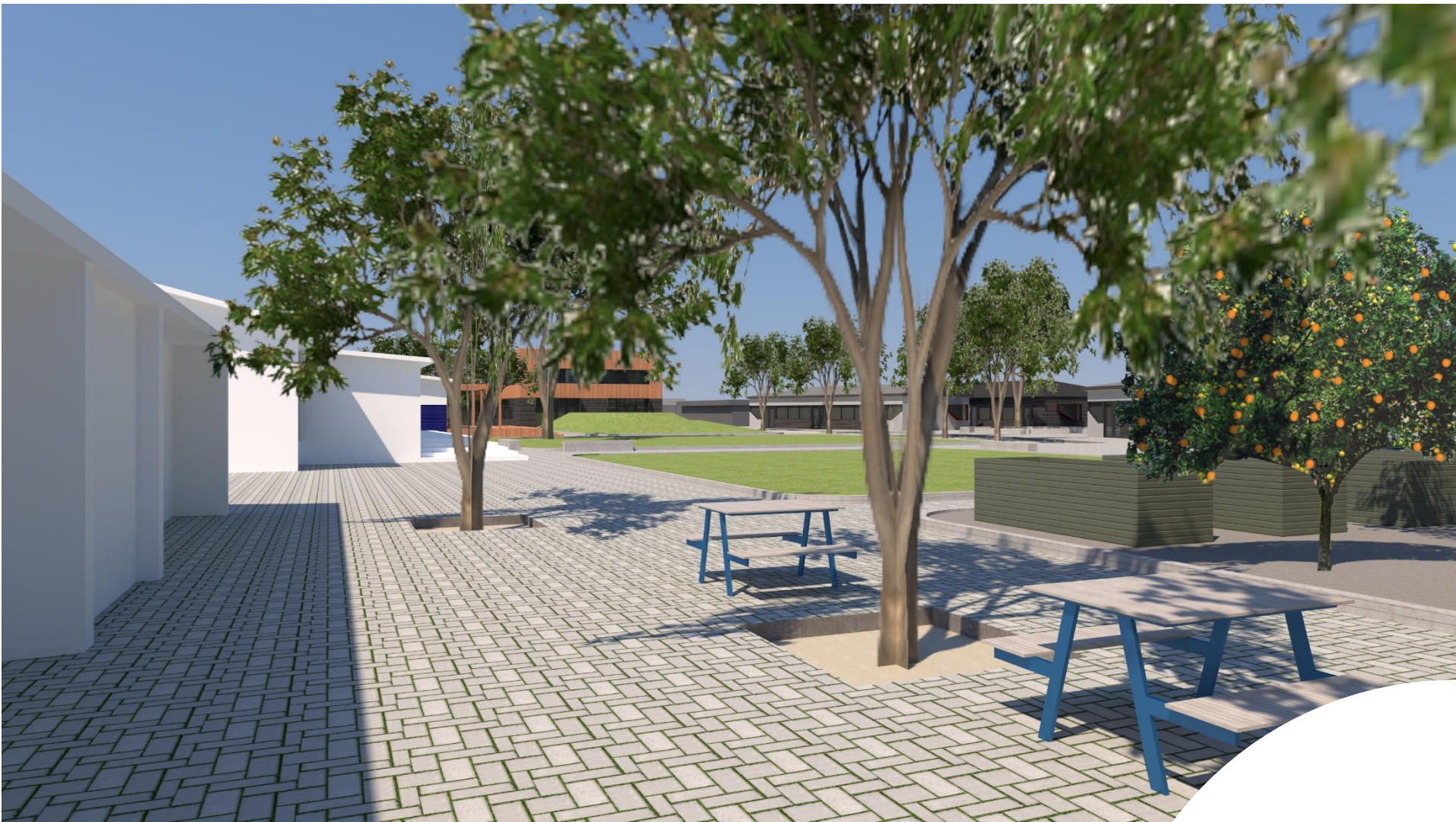
VIEW FROM FOOD TECHNOLOGY COURTYARD TO CENTRAL LAWN